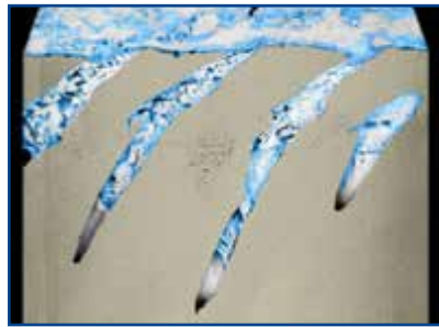
Novel data fusion image combining 3D imaging data overlaid with DSIMS stannous data (blue) from the same